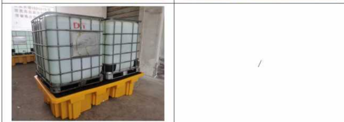
During in testing 测试中