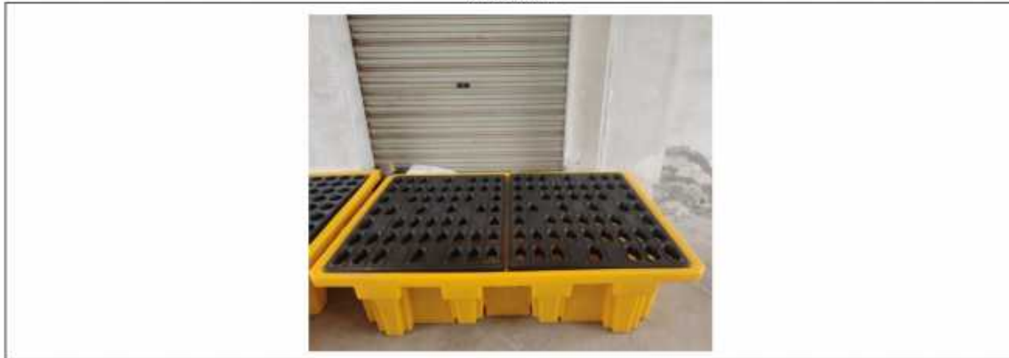
Before Testing 测试前